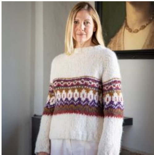
CHART is worked in stocking st. (= knit all rounds). Read CHART from bottom up and from right to left. This project is worked in the round from the top down with raglan sleeves.

OTHER = stitch markers, tapestry needle.