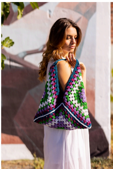
Schema 1: motivo granny