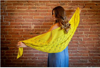
Punto lume di candela