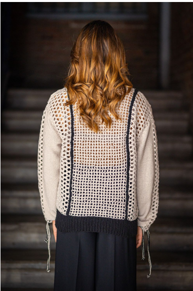
Schema 1: Puntino rete-blei