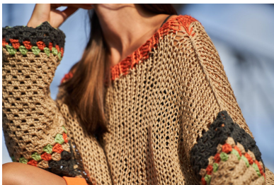
Schema: inizio della manica (lavorazione granny)