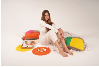
Schema 1: pannello corda a punto archetti sfalsati