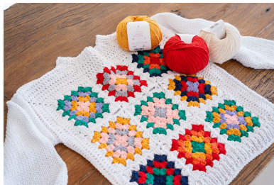
Schema 2: unione dei motivi, bordo e spalla