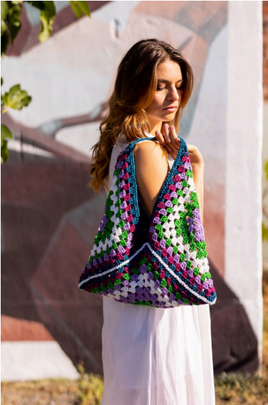
Schema 1: motivo granny