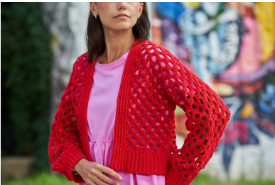
PANNELLO PRINCIPALE DEL CARDIGAN